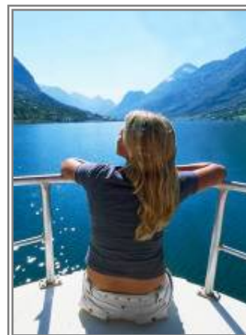
Cruising in the Nærøy Fjord, Terje Rakke/ Nordic Life/Fjord Norway