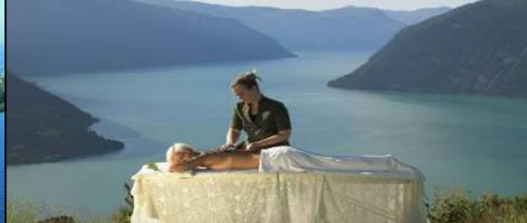
Unique spa experience, Bestebakken in Fjord Norway