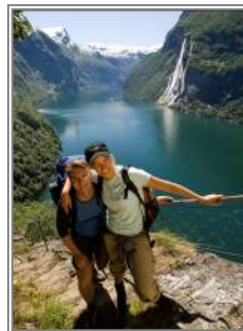
Geiranger Fjord

For more tour suggestions in the Oslo region, go to www.visitoslo.com