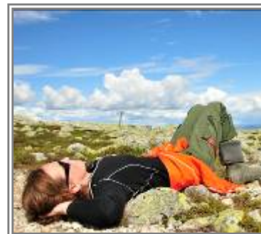
Relaxing in the sun, Destination Trysil/Utefoto.no